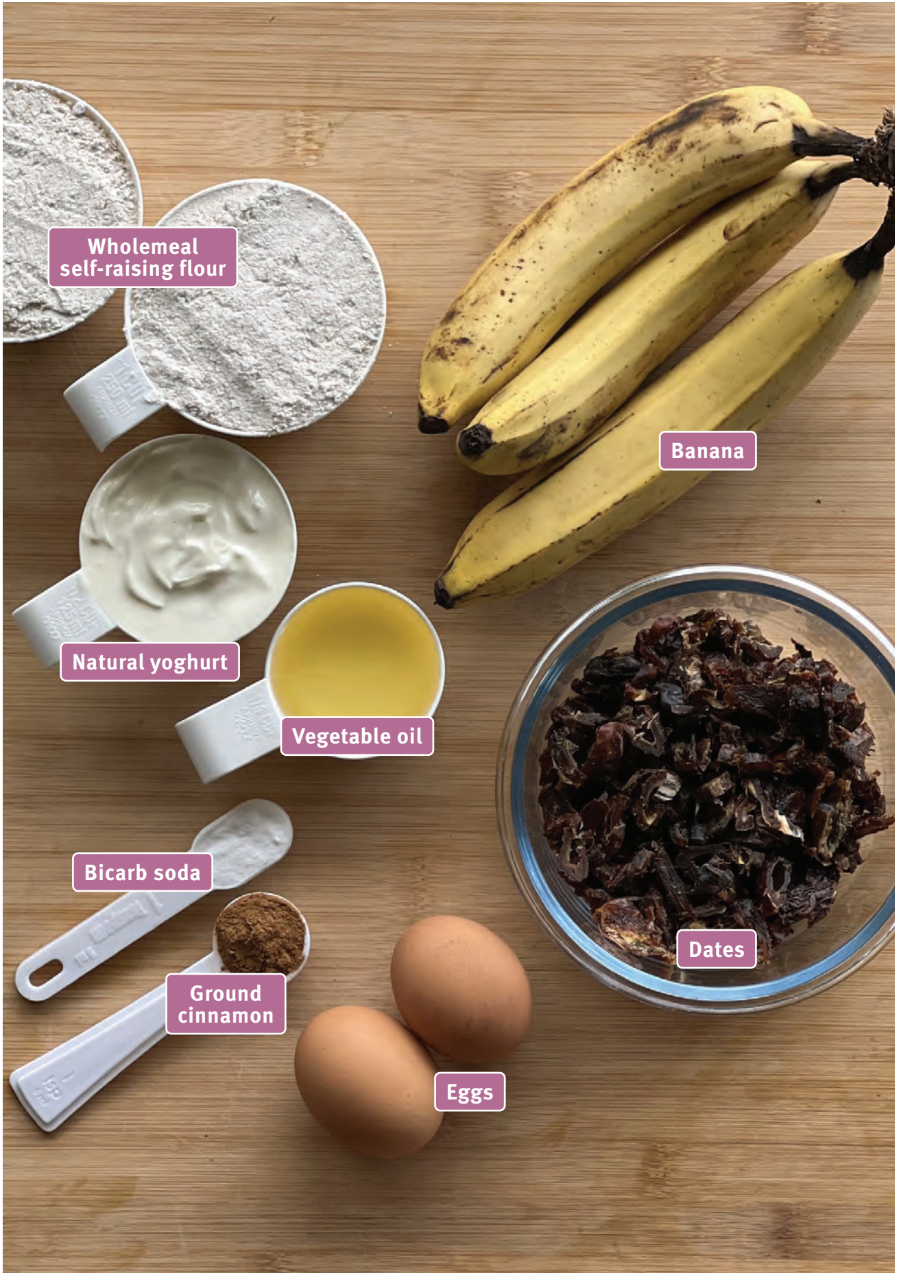
Wholemeal self-raising flour